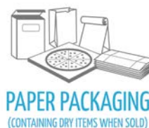
PAPER PACKAGING (CONTAINING DRY ITEMS WHEN SOLD)